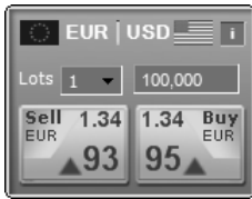
Figure 2-1: A dealing box from the FOREX.com trading platform for EUR/USD shows the current bid and offer price. The “bid” (on the left) is the price at which you can sell Euros. The “offer” on the right, is the price at which you can buy Euros.

For example, in Figure 2-1 the full EUR/USD price quotation is 1.3493/95. The 1.34 is the big figure and is there to show you the full price level (or big figure) that the market is currently trading at. The 93/95 portion of the price is the bid/offer dealing price.